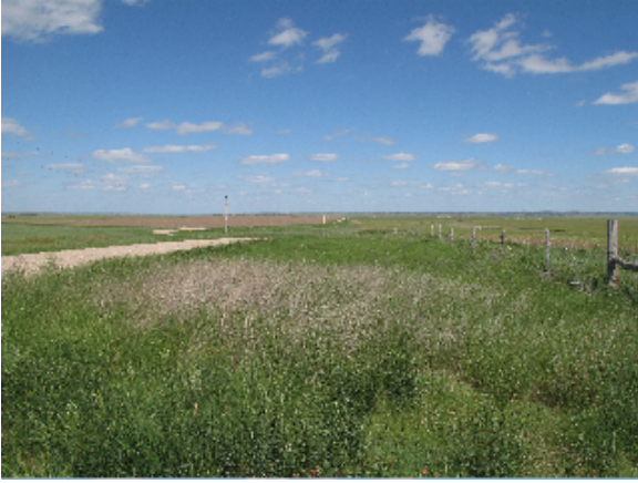
The drought for us is officially over!