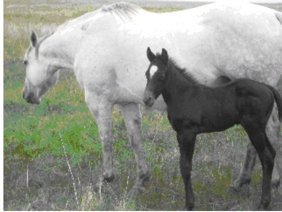
Molly and Moe