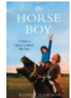
The Horse Boy Rupert Isaacson

office@rethinkingschools.org (for subscriptions)