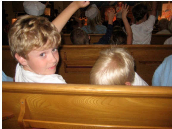
We peaked around.