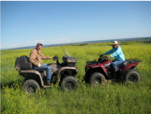
Our 44th anniversary celebration: ... A gift we gave ourselves.