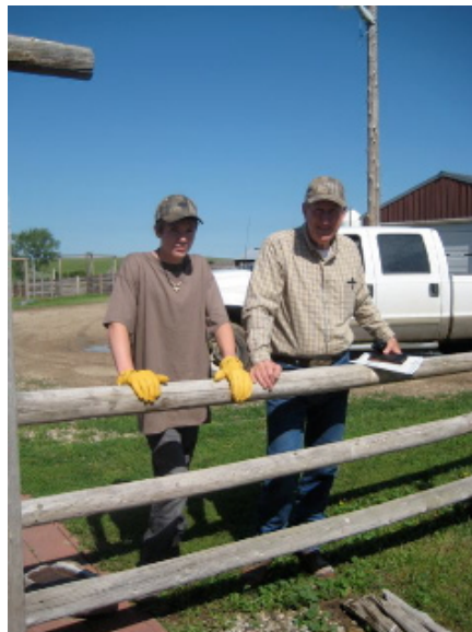
Wyatt and BopBop

http://identify.whatbird.com/obj/282/_/Long-billed_Curlew.aspx