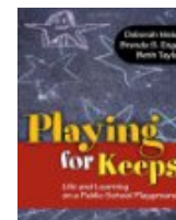
Playing for Keeps