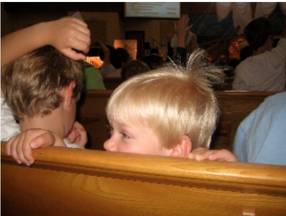
We peaked some more.