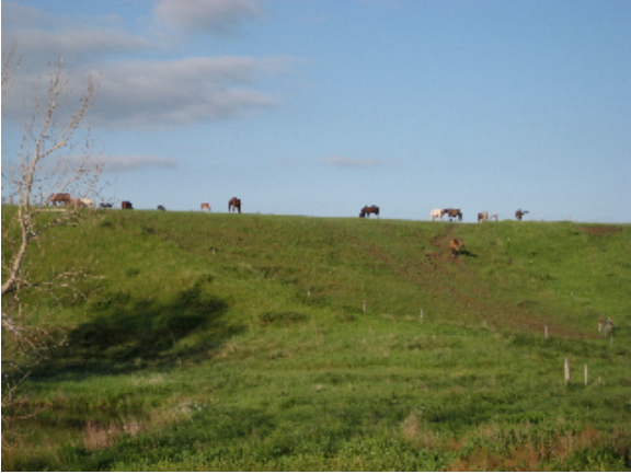
Horses on the Hill