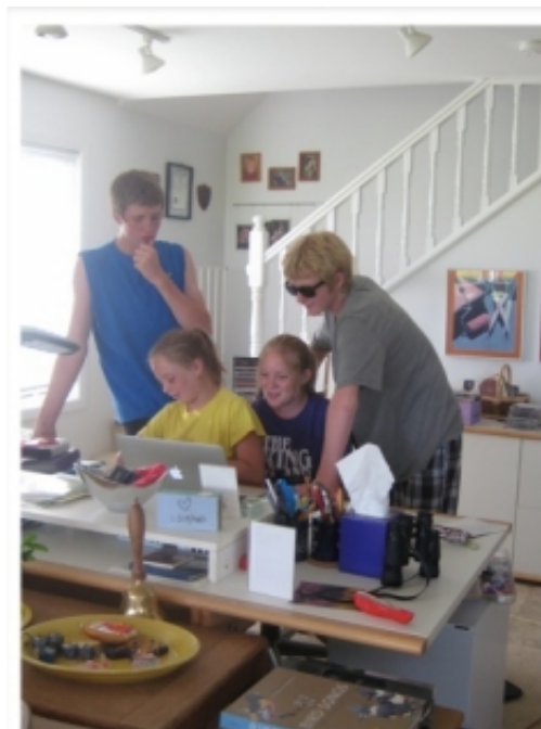
And, we had lots of interesting problems to solve.