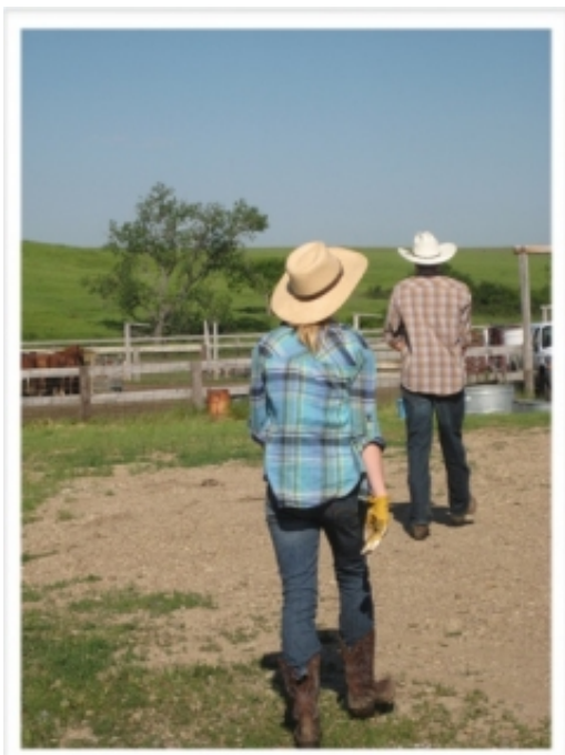
BopBop and clean kids at the Capitol