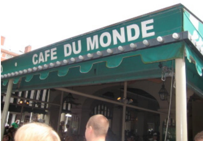
Cafe Du Monde