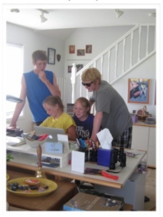
And, we had lots of interesting problems to solve.