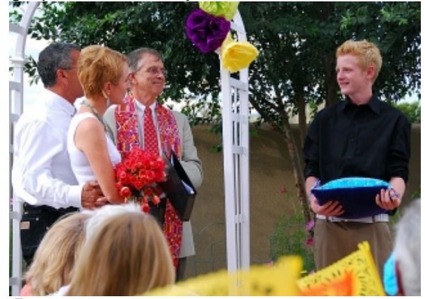
The Best Papel Picado Posts

Luke: The Best Wedding Speech of the Day.