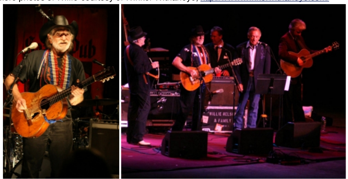
http://www.youtube.com/watch?v=iZaZqx9v3dU, How Time Slips Away http://www.youtube.com/watch?v=5u5LZ-DN3iA, You Were Always on my Mind http://www.youtube.com/watch?v= 0jOR5DC0rM, Crazy