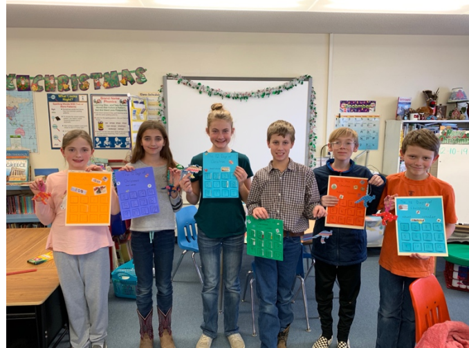
Tance taught us about advent calendars from Germany.

The next day on Christmas Day, they wake up really early in the morning to go to church at 5 in the morning. After that they will celebrate Christmas with their families, and then celebrate the new year. January 13 they will take all of their decorations down because they have celebrated their full month of Christmas.