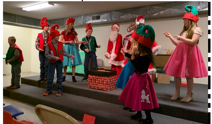
Singing "Rockin' Down the Chimney Tonight"