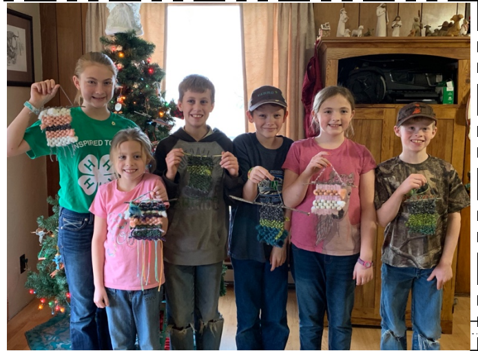
Hopeful Hooves 4-H Members