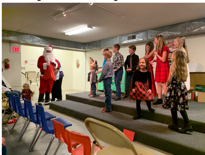
...and then Santa came!