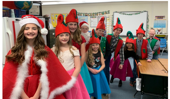
The Cast of "Santa's Stuck in the 50's!" all lined up before the show!

Mrs. Claus and the elves were cleaning out the attic when they found toys from the 50's.